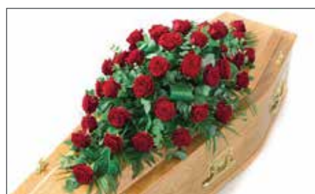
Floral Tributes - Rose Coffin Spray