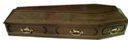
Derg African ayous wood with a matt finish.