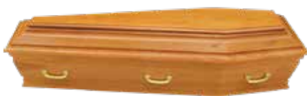
Bann European pine coffin with a satin finish.